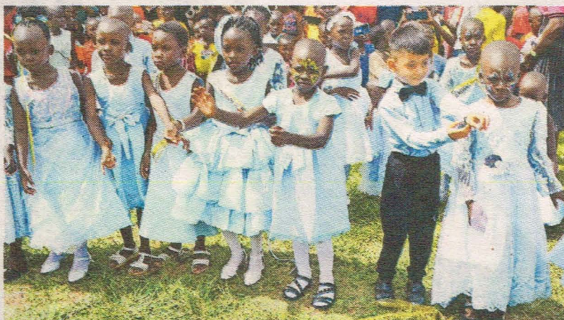
Graduands get ready to present an item thanking parents and teachers.

Centenary Bank Kamuli Branch and Oasis Book project donated the graduation cake and an assortment of gifts to the graduands, urging parents to keep the children reading during holidays.