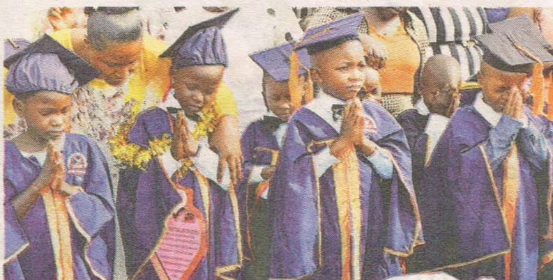
A teacher assists some of the graduands in prayer.