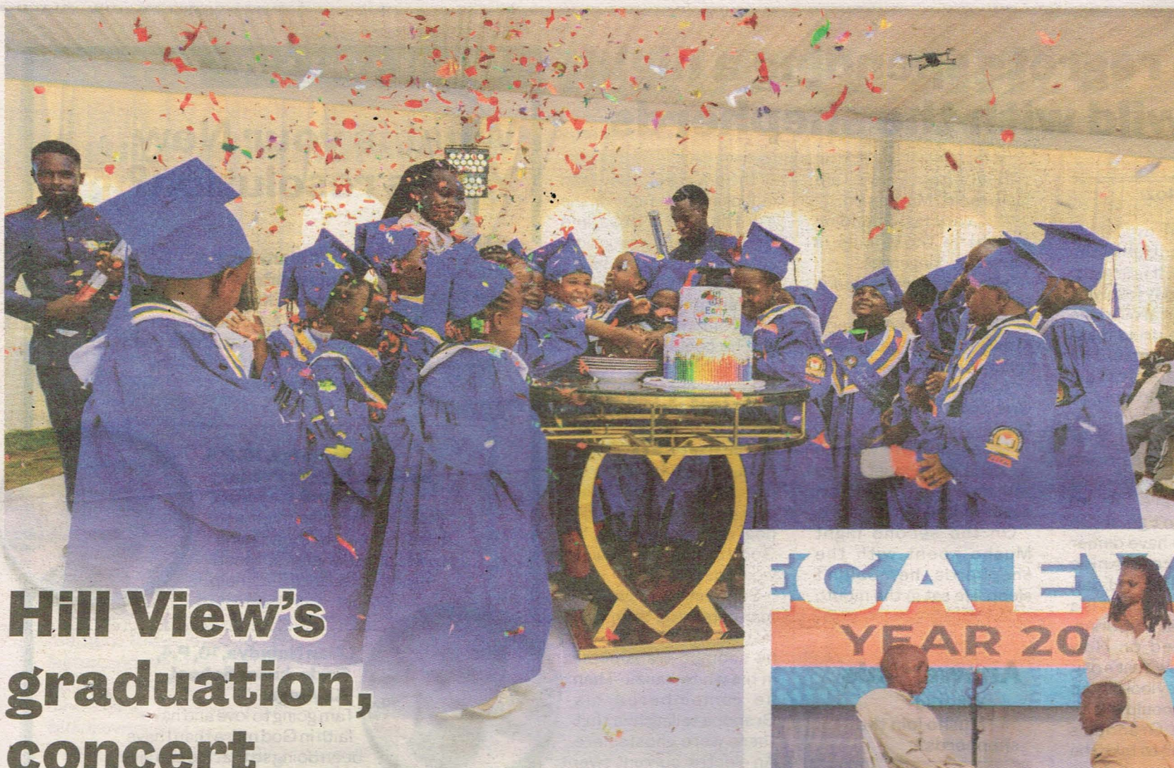
Top Class pupils cut cake to celebrate their milestone.