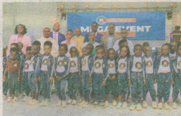
Pre One and Pre Two learners pose for a photo with the school director and other administrators.