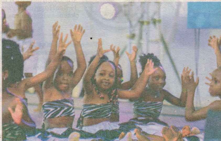
Pre Three ambassadors perform a creative dance.