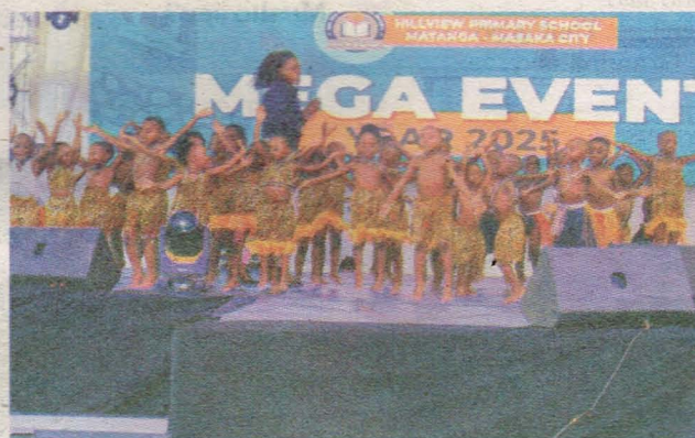
Pre One and Pre Two ambassadors performing a creative dance