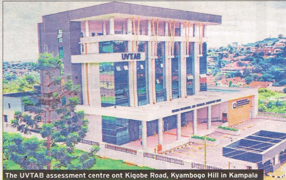
The UVTAB assessment centre on Kigobe Road, Kyambogo Hill in Kampala