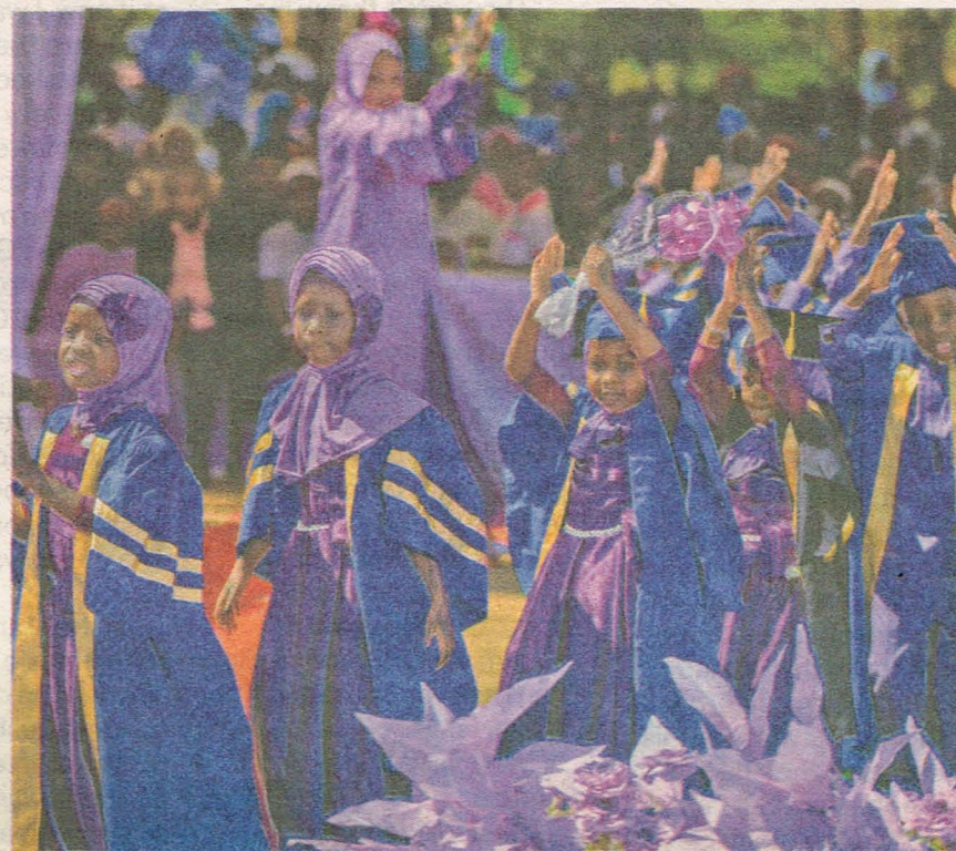
Pupils dance as they assume the stage.

"You have used these hands to paint masterpieces and help friends who have fallen. We are so proud of the people you are becoming."