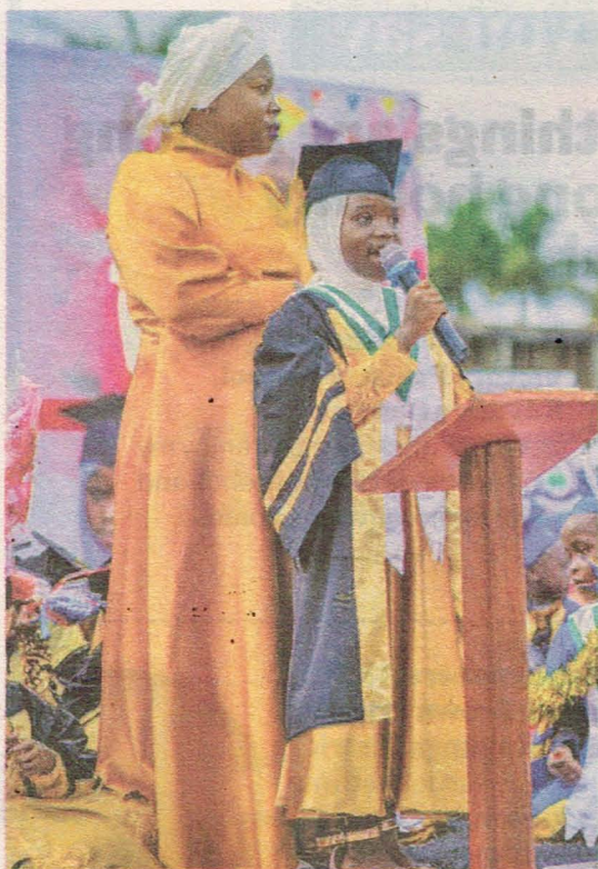
A Top Class representative delivers a speech to the parents and fellow learners.