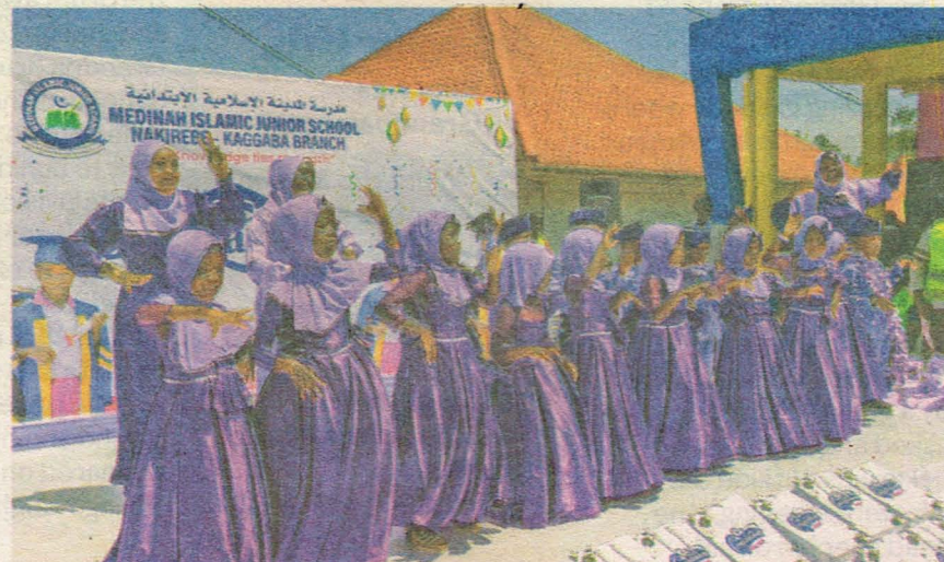
Children during a performance.