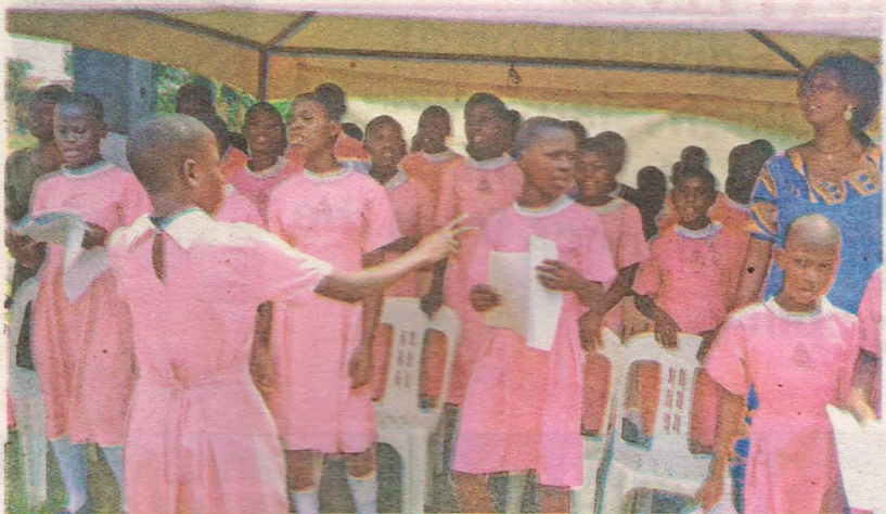
The school choir sings during Mass.