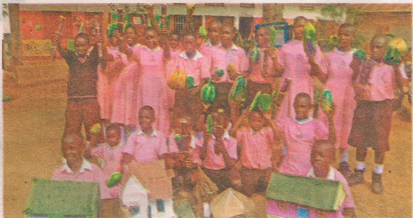
Children show off some of their crafts made from waste materials.