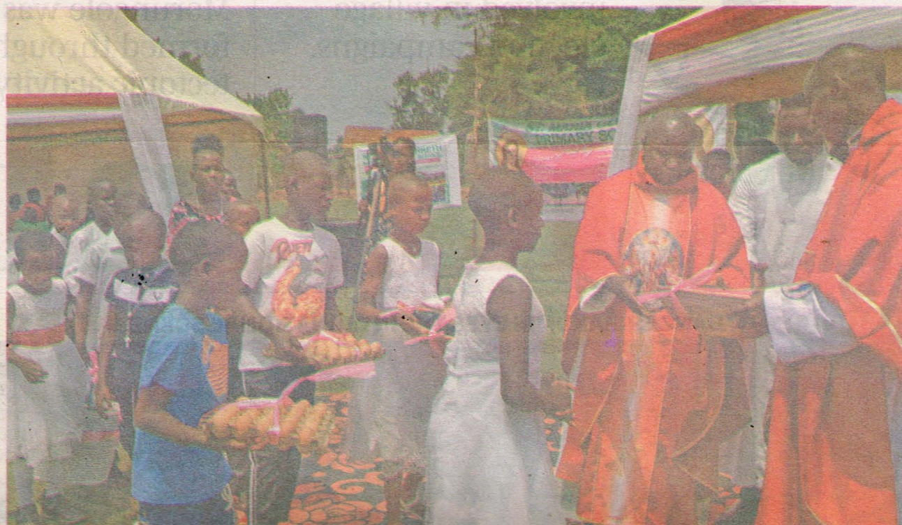
Children who received their first Holy Communion give their offertory during Mass.