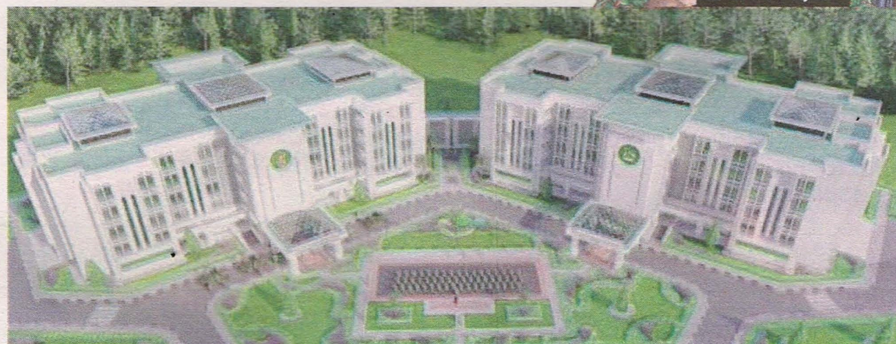
The artistic impression of the new MODVA/UPDF Headquarters due for completion in November 2026 will enhance operational efficiency.

Images of UPDF soldiers in tattered uniforms and worn-out gumboots during the height of the northern war once shocked the world. "We simply did not have the resources to properly clothe the force," Magezi recalls.