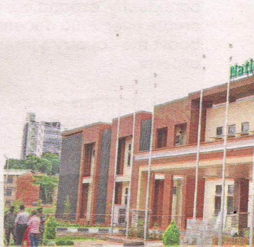
UPDF National Referral Hospital, Mbuya in Kampala offers services to all