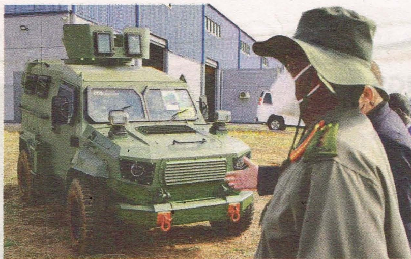
President Museveni inspecting armored vehicles made by NEC Streit in Uganda