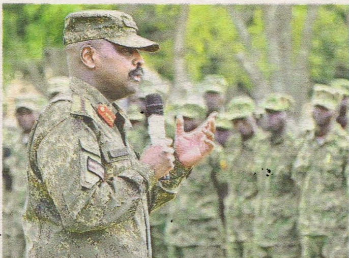
Gen. Muhoozi Kainerugaba talking to UPDF troops in Gulu