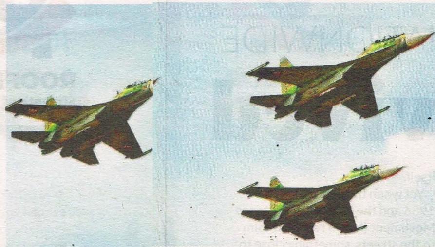
UPDF fighter jets are part the modern equipment acquired by UPDF