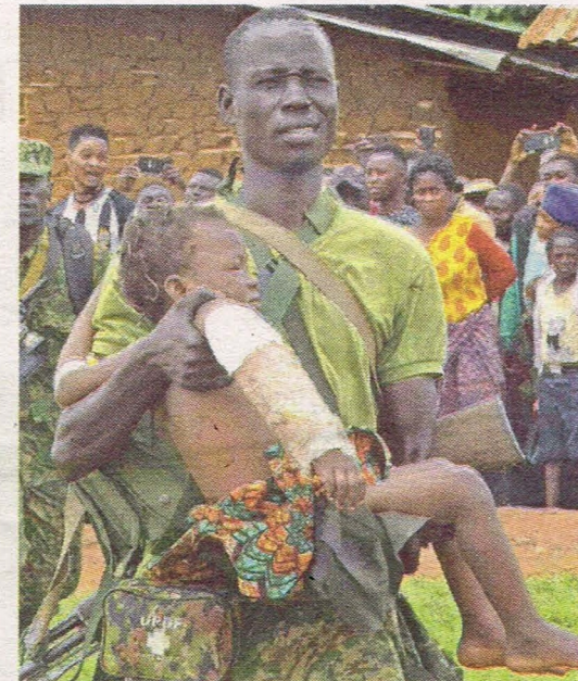
The Uganda People's Defence Forces rescuing a child from the Allied Democratic Forces (ADF) rebel captivity

The Ministry of Defence and Veteran Affairs, together with the Uganda People's Defence Forces, join Ugandans in commemorating the 40th National Resistance Movement Liberation Day, under the theme, Tribute to the patriots who ushered in a fundamental change.