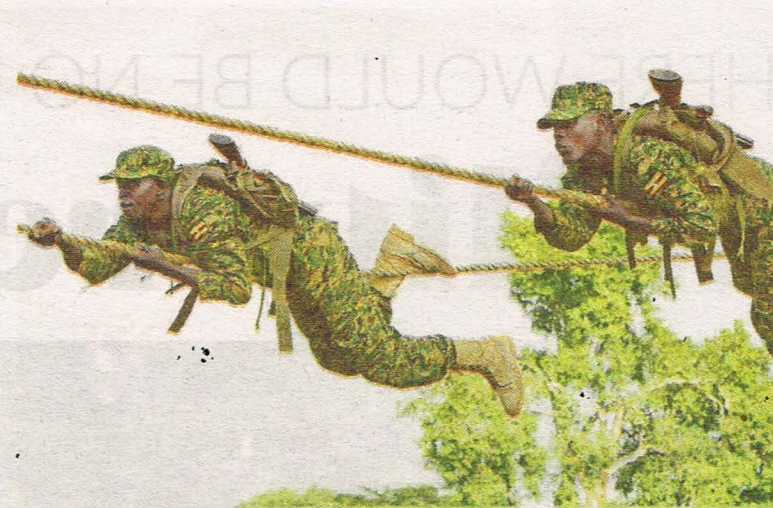
Passing out of Uganda People's Defence Forces recruits at Oliver Reginald Tambo School in Kaweweta