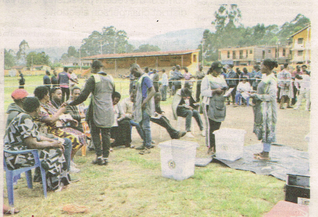
Polling officials scan the ballot papers using the Biometric Voter Verification Kits machines after voting ended in Kabale Municipal Stadium in Kabale District.