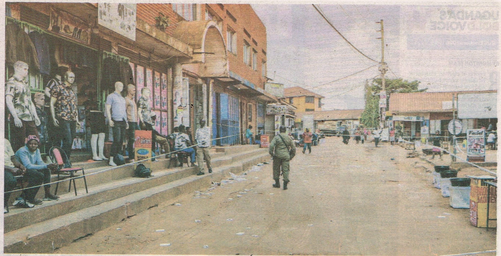
A police officer supervises the election process in Kawempe Division as agents and Electoral Commission officials wait for voters yesterday.