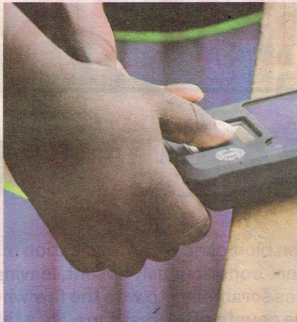
An election officer tests a Biometric Voter Verification Kit. The machines were used to identify voters at polling stations in Katwe, Kampala.