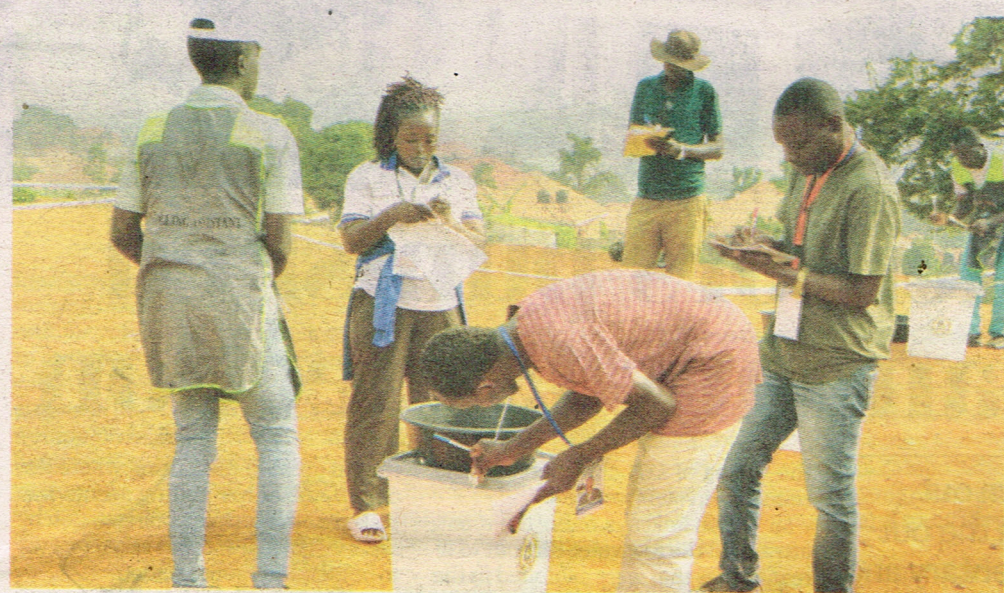
A polling officer fixes a seal on a ballot box before the voting exercise commenced in Nansana Municipality, Wakiso District.