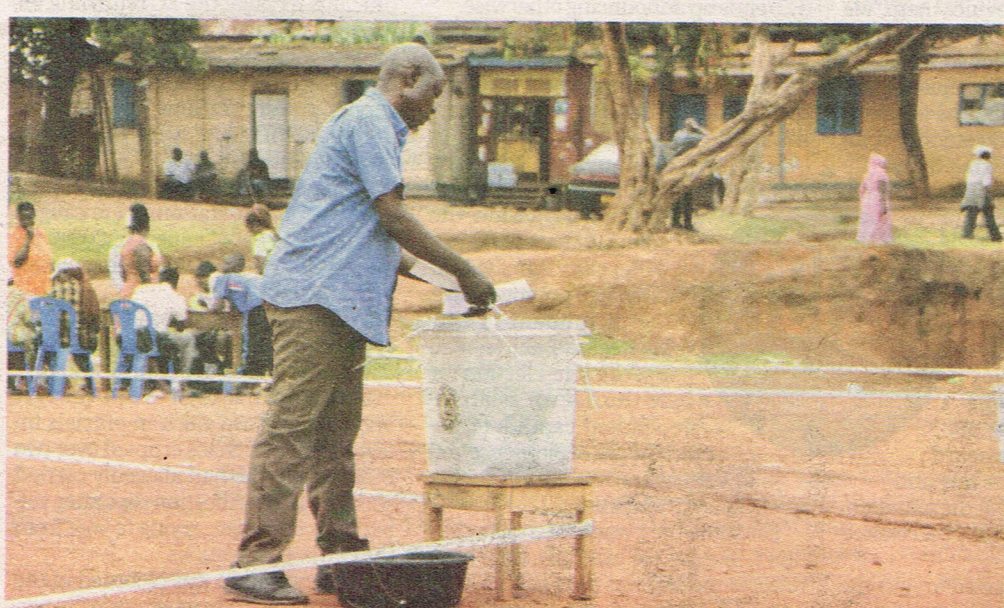
A man casts his vote to choose his preferred mayor for Kira Municipality at Kireka Rehabilitation Centre yesterday.