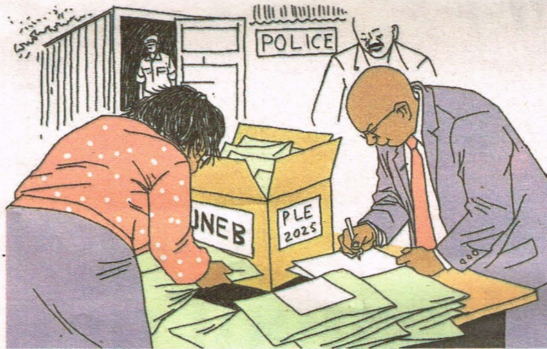
They are then taken to the school by the head teacher and examination distributor.