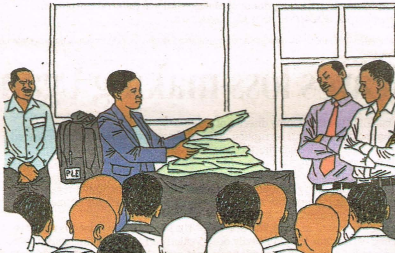
At schools, exam papers are handled by the Uneb supervisors.