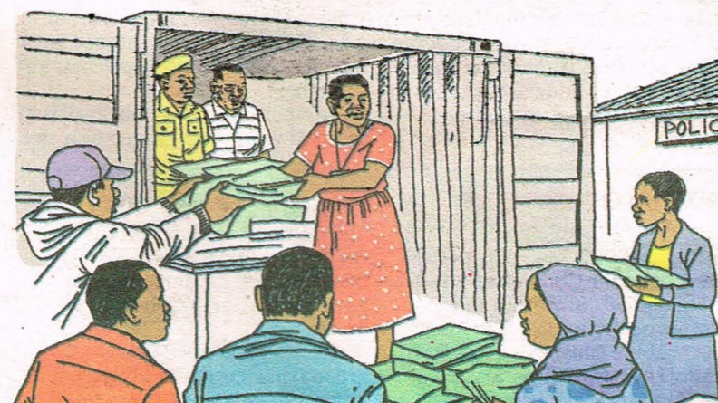
After exams are done the papers are sealed and returned to Uneb for marking.