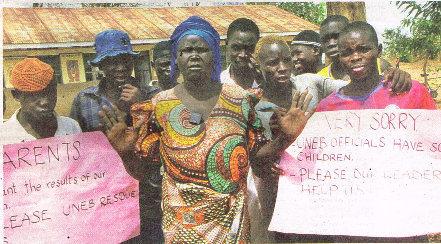
Angry parents and other locals demonstrate at the Bamure Primary School in Koboko District, West Nile, after learning about the unfortunate occurrence that has placed the future of 34 pupils in jeopardy.

Dashed dreams: The future of 34 PLE candidates from Bamure Primary School in Koboko District has been left hanging by a thread after it was discovered that officials from the Uneb and school authorities failed to submit their final exam scripts for the Integrated Science subject, despite the pupils having sat for the paper. ...P.4,5