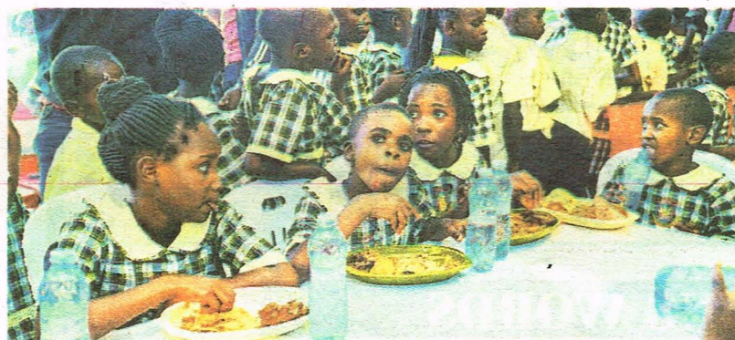
The lunch break gave learners time to re-energise before embarking on more adventures.