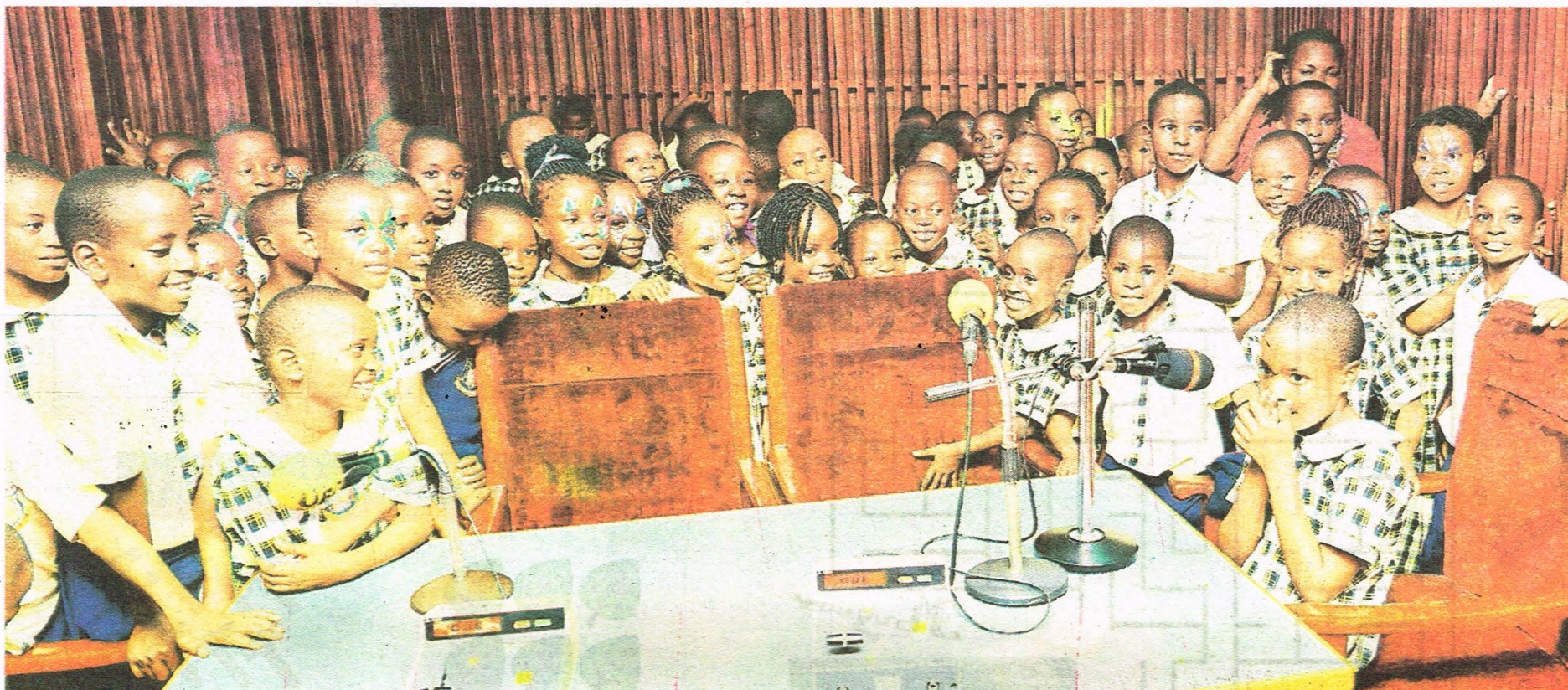
Children enjoy a moment on the airwaves of Uganda Broadcasting Corporation (UBC) radio.