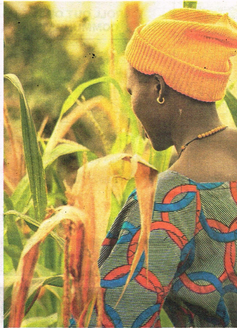
A woman in a maize garden. Scientists say the parasitic plant known as striga, or witchweed, is a challenging weed to crops like maize, millet and sorghum.