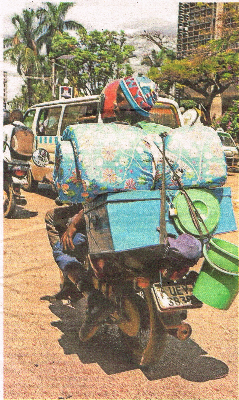
School children on boda boda with their luggage on Kampala Road yesterday. The low turnout in most schools was attributed to failure by some parents to raise school fees and other requirements.