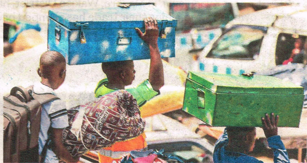
Children with their suitcases at Old Taxi Park in Kampala yesterday.

munity, with parents deliberately choosing to bring children in the second week of the term without any sound reason.