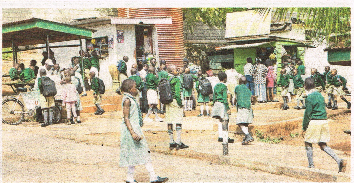
Some of the pupils who reported yesterday at Nakasero Primary School, Kampala.

teacher of Kinchinjaji Primary School, warned that pupils are expected to sit the beginning of term exams today and asked the parents to ensure the pupils report to school.