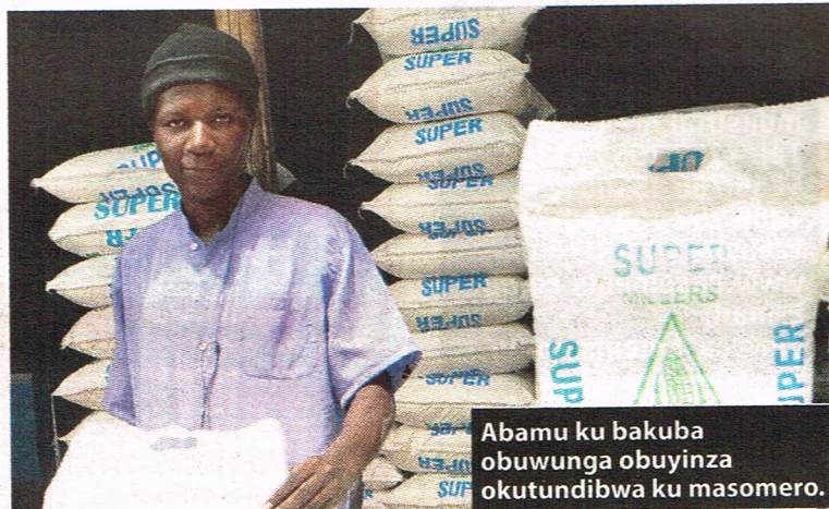
Abamu ku bakuba obuwunga obuyinza okutundibwa ku masomero.

Ku ky'okubeera ne bizinensi empanziise, yalaze nti, amasomero gakolagana ne bizinensi empanziise mu mateeka