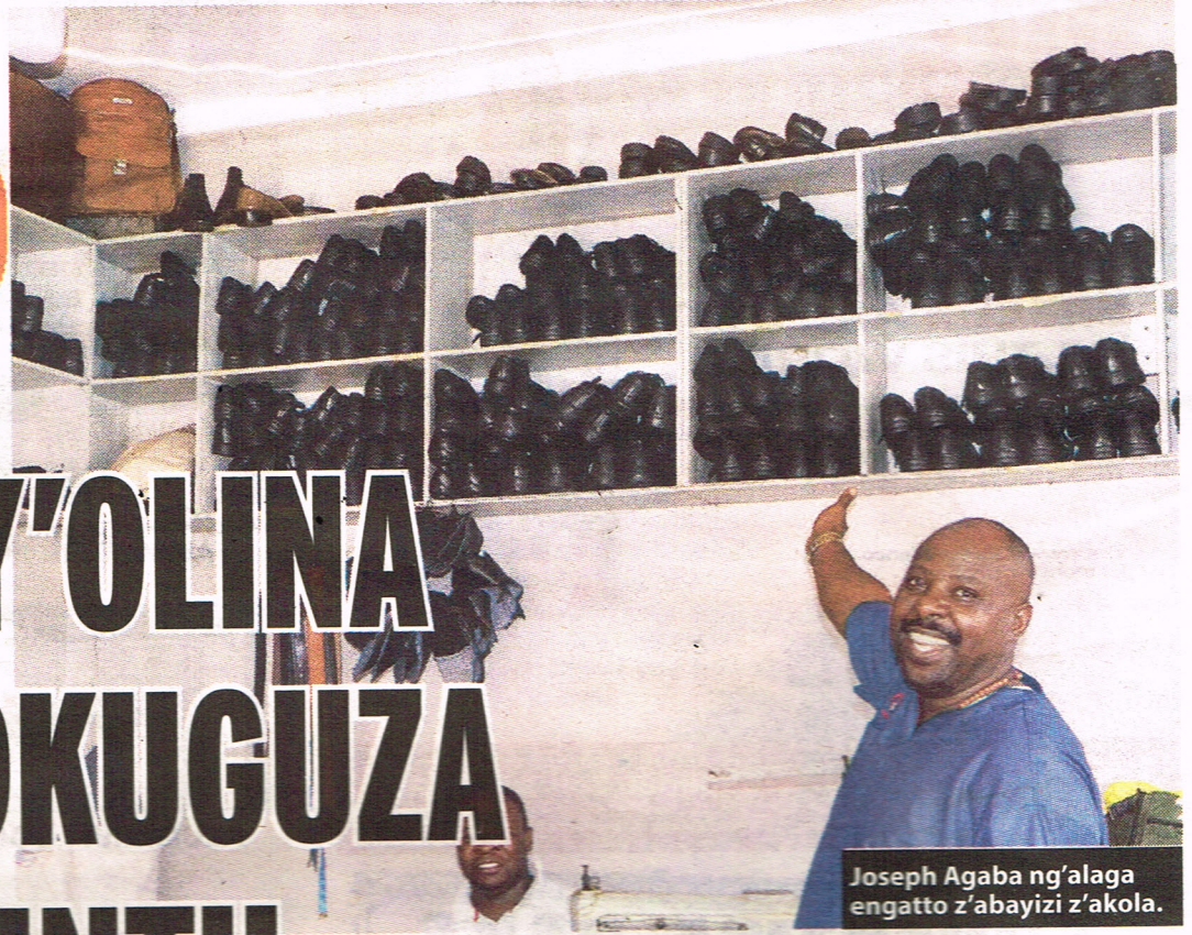
Joseph Agaba ng'alaga engatto z'abayizi z'akola.