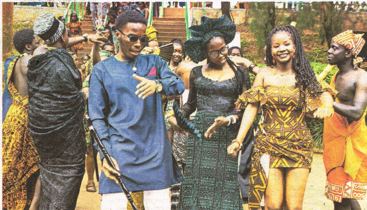
When the Naija vibe arrived...none could beat it...well done guys.