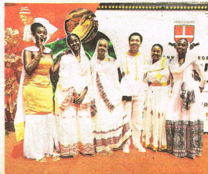
We bring greetings from Ethiopia and Eritrea...For y'all that dunno, the gurls look sleek in their habesha kemis.