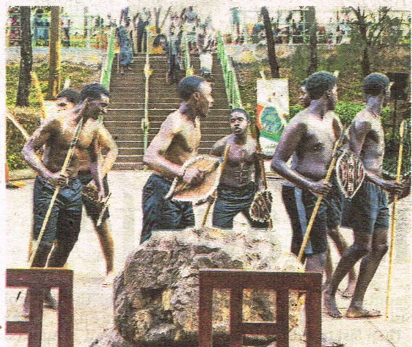
Remember the good ol' gods must be crazy!