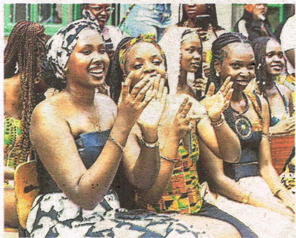
If we kenat...let's clap for them!