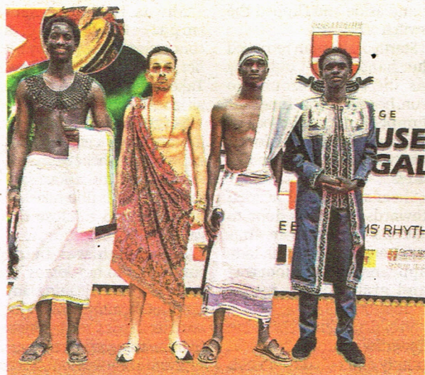
Time to show some packs.. but one of you chickened out!