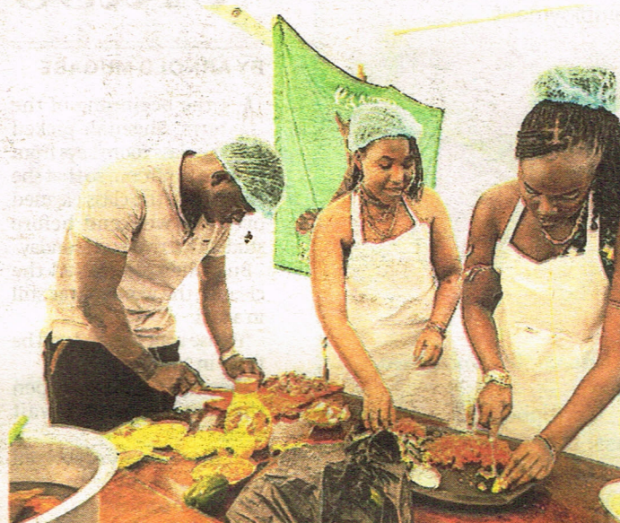
Colleagues, food is coming ...so, you know this is the heart of cultural fete!