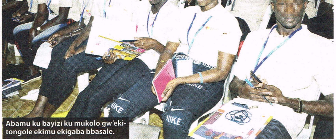
Abamu ku bayizi ku mukolo gw'ekitongole ekimu ekigaba bbasale.

Yagambye nti abasomesa b'eddiini tebalima musaala mugereke gwe bafuna ate nga bakola omulimu munene nnyo okugunjula n'okusomesa eddiini ng'emu ku