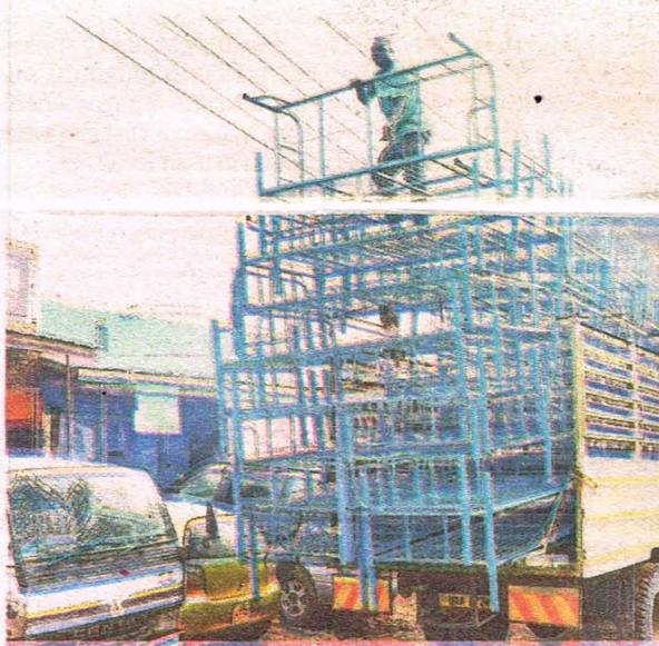
People load a truck belonging to Namilyango College with beds on February 1.