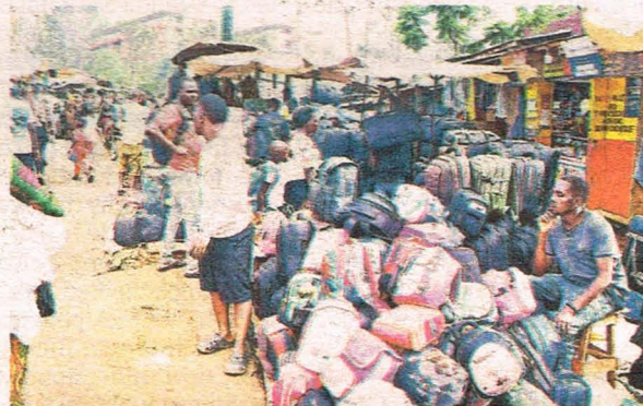
A vendor sells second hand bags at Nakawa market on February 1.