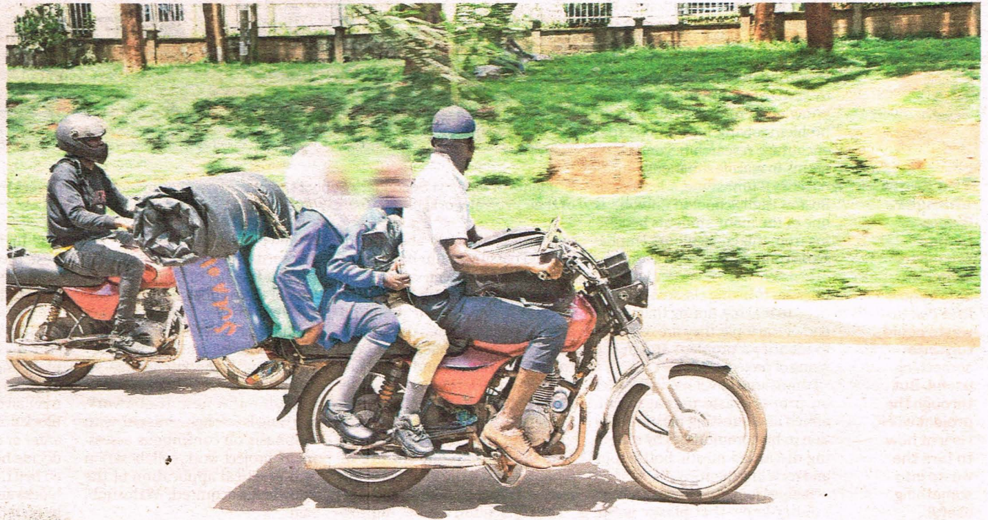
A boda boda ride transports children to school on Jinja Road on February 11.