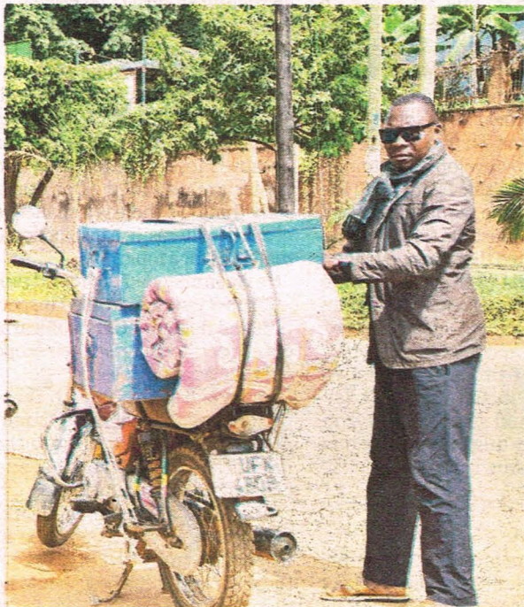
← A boda boda rider loads his motorcycle with luggage of a student on Kira Road on February 10.