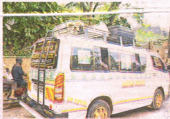
A taxi transports learners following the opening of schools for Term One on February 11.