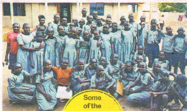
Some of the school prefects and club executives.