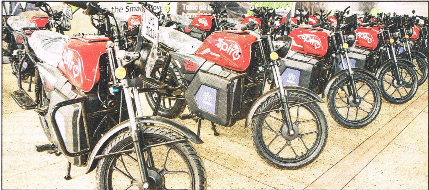
Some of the electric motorcycles on display during the launch of the 'Zuukuka Make the Smart Move' campaign at the UMA Multipurpose Hall yesterday