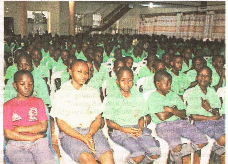
Pupils listen to the Mass proceedings during Ash Wednesday.