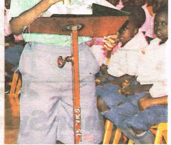
A pupil takes a reading during Mass.