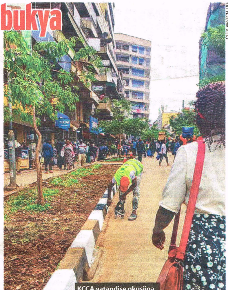
KCCA yatandise okusiiga obugulumu okwongera okunyiriza ekibuga.