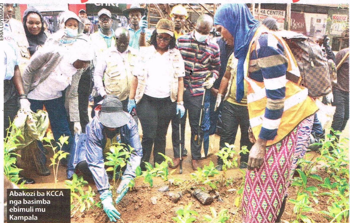
Abakozi ba KCCA nga basimba ebimuli mu Kampala