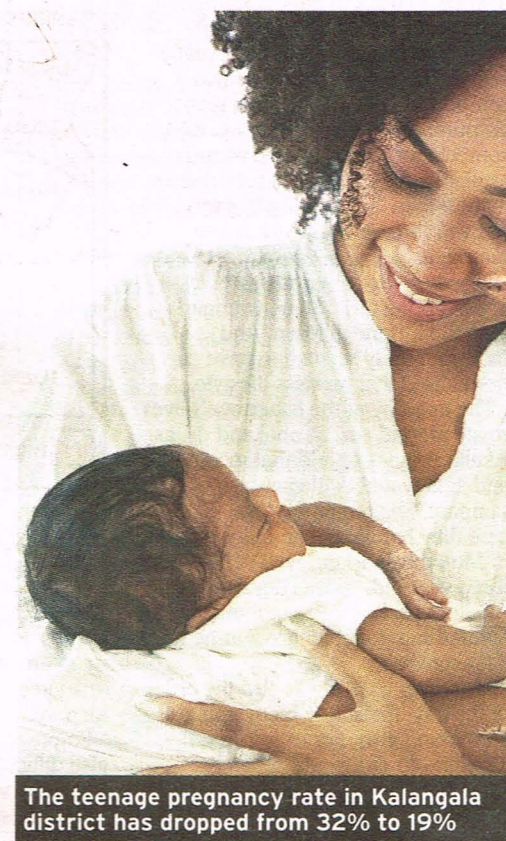
The teenage pregnancy rate in Kalangala district has dropped from 32% to 19%