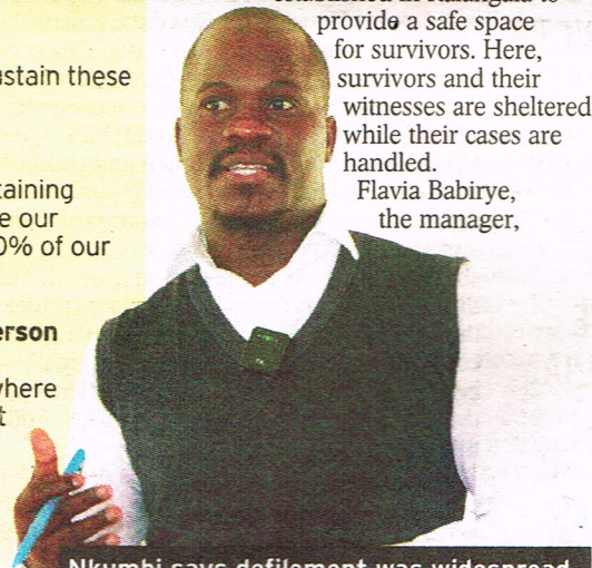
Nkumbi says defilement was widespread

The COVID-19 lockdown hit us hard. The situation was worse in Mazinga islands, where I come from. Many girls became pregnant and dropped out of school. But also, poverty is rampant. Kalangala depended on the lake but that is no more. But also many parents are negligent. They look on as their children get spoiled.