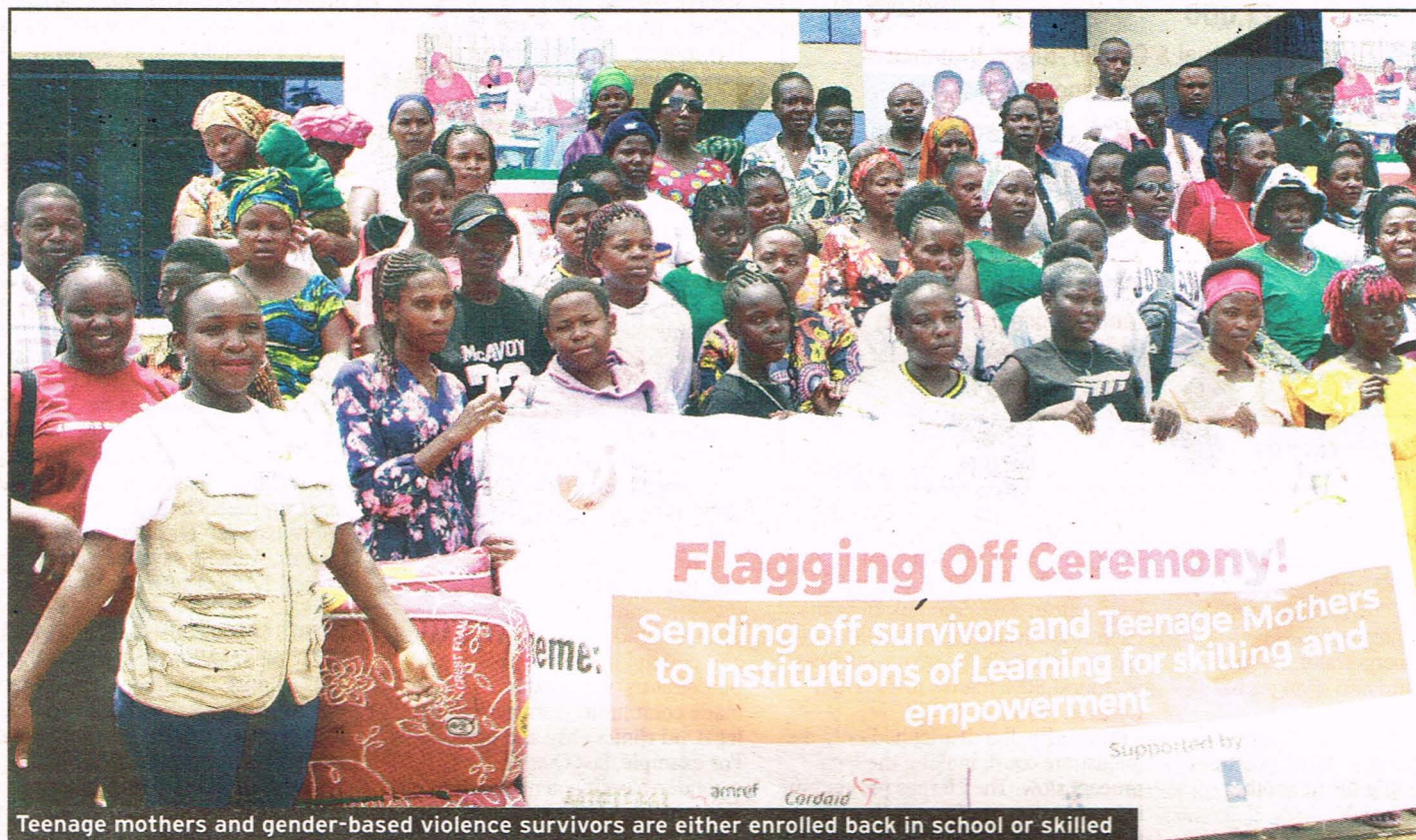
Teenage mothers and gender-based violence survivors are either enrolled back in school or skilled

POWER • RELATIONSHIPS • FAMILY • YOUR QUESTIONS