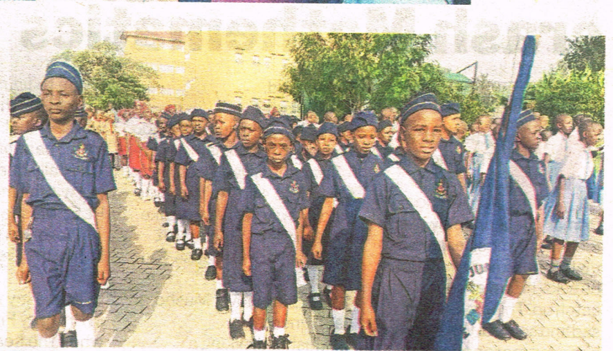
The brigade honoured former candidates for their outstanding performance in PLE.

Out of the 351 candidates who sat for the exams last year, 225 came in division one and the rest in division two.