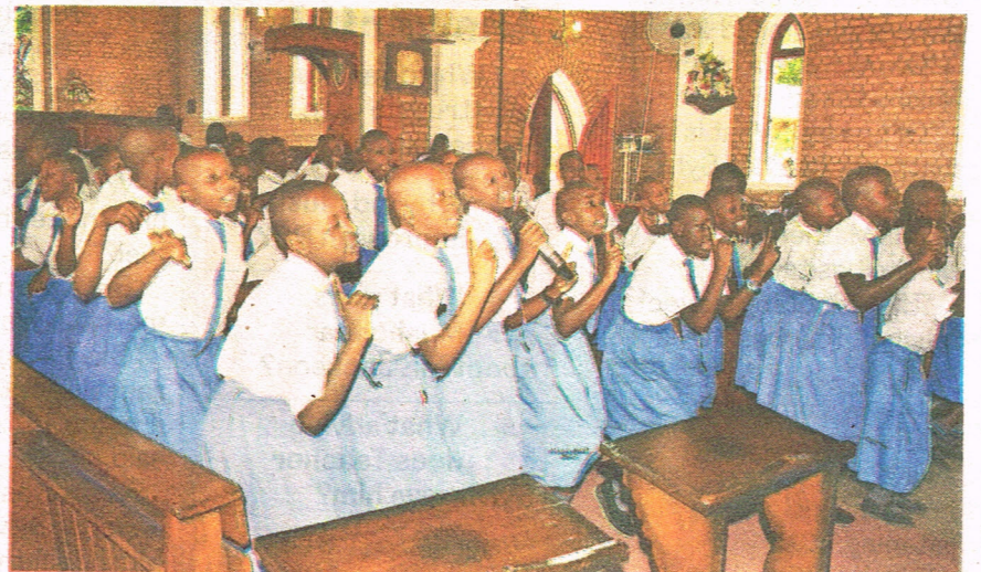
Pupils entertain guests at St James Cathedral during the thanksgiving.