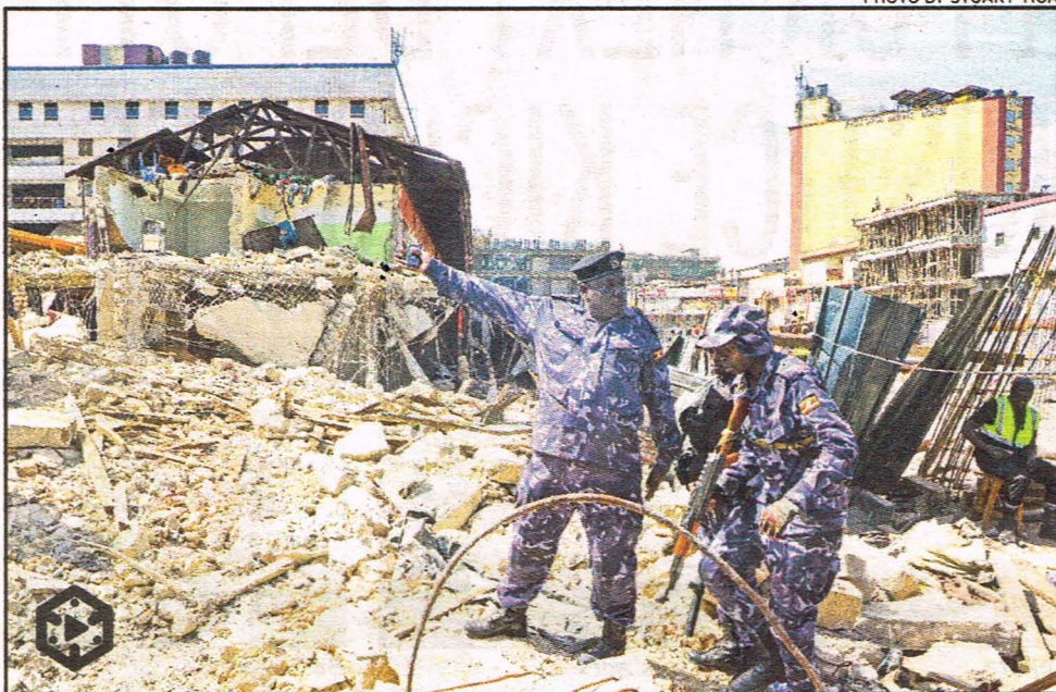
Police officers manning security at a demolished structure at St Balikudembe Market (Owino) yesterday. The structure housing 46 lock-ups is suspected to have been demolished by city businessman Hamis Kiggundu on Saturday night. (Scan photo using Vision Digital Experience to watch video)

"On top of that, as advised by CAF (Confederation of African Football) officials, Nakivubo Stadium cannot fit an international standard when the open drainage channels are left around it," he said.