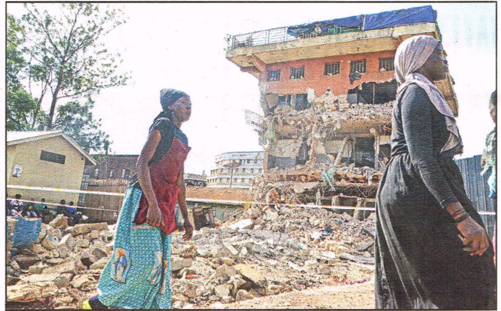
The structure on the land reportedly formerly owned by Tayebwa, located near Nakivubo Settlement Primary School in Kampala city, was dismantled on March 9

Under the arrangement, Namatiti constructed a water-borne toilet for use by students,