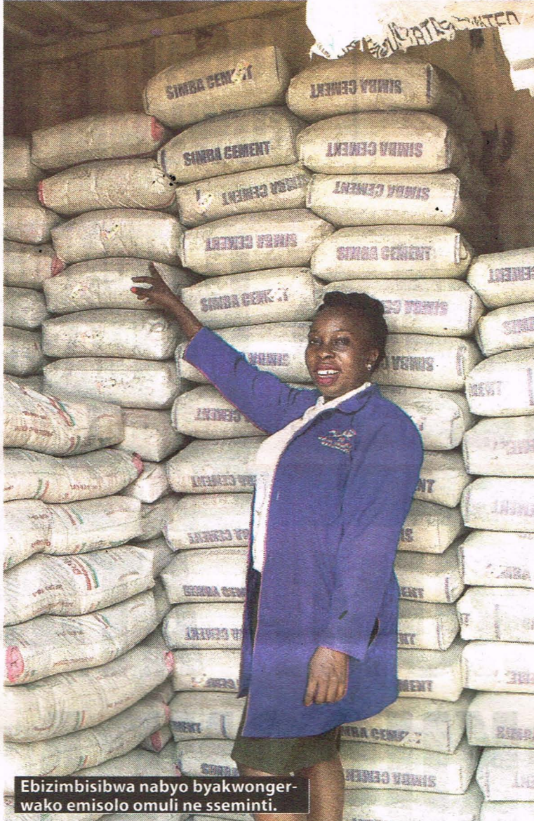
Ebizimbisibwa nabyo byakwongerwako emisolo omuli ne sseminti.

Bwe baavudde ku mwenge ne bakwata ku ssukaali. Buli kkiro ya ssukaali Gavumenti ebadde