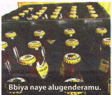
Bbiya naye alugenderamu.