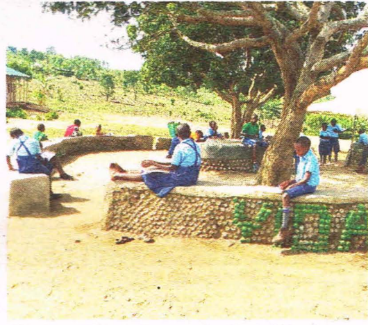
Pupils of Youth Initiative Primary School in Kyaka II refugee settlement used plastic bottles to build benches in their school compound. This is a creative way to reuse plastic.