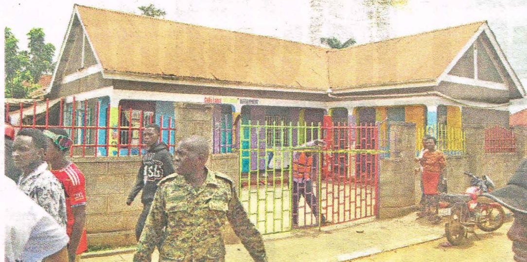
Four babies were hacked to death at a daycare centre in Ggaba, a Kampala suburb, on Thursday