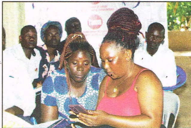
Some of the participants who attended the micro, small and medium enterprises training in Buvuma recently