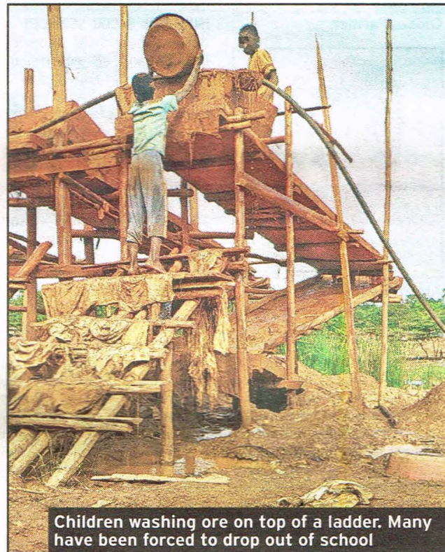
Children washing ore on top of a ladder. Many have been forced to drop out of school

There have been reports of cross-border and informal gold networks, normally in Kenya. These networks have expanded the need for cheap, flexible labour, which has often been filled by children.