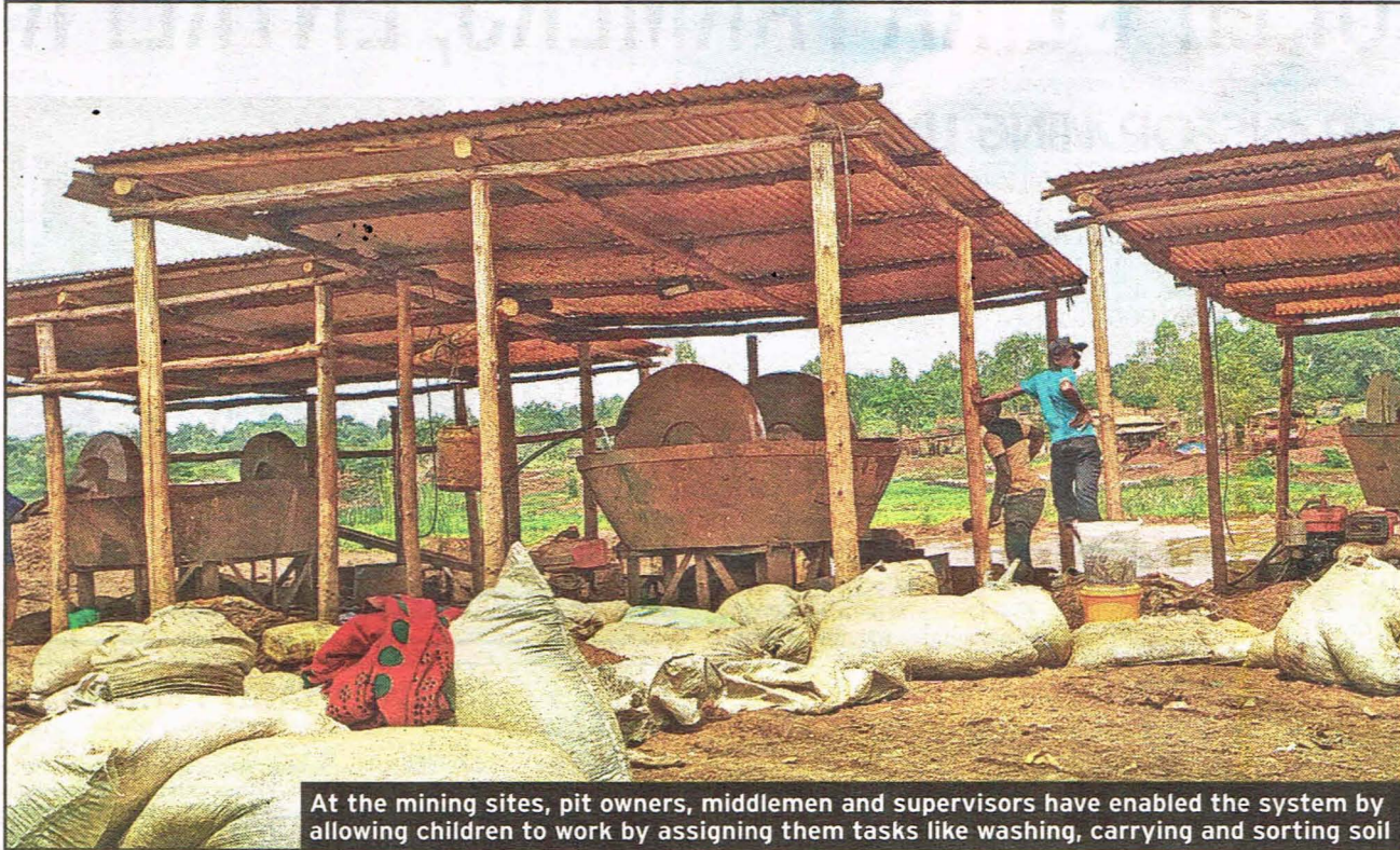
At the mining sites, pit owners, middlemen and supervisors have enabled the system by allowing children to work by assigning them tasks like washing, carrying and sorting soil

I discovered Namayingo is a melting pot of tribes, with