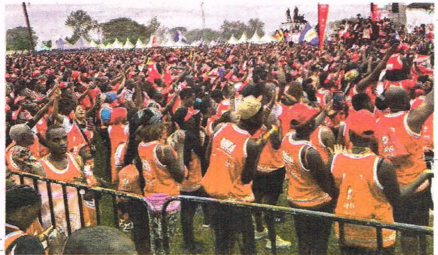
The run will benefit the fight against HIV/Aids