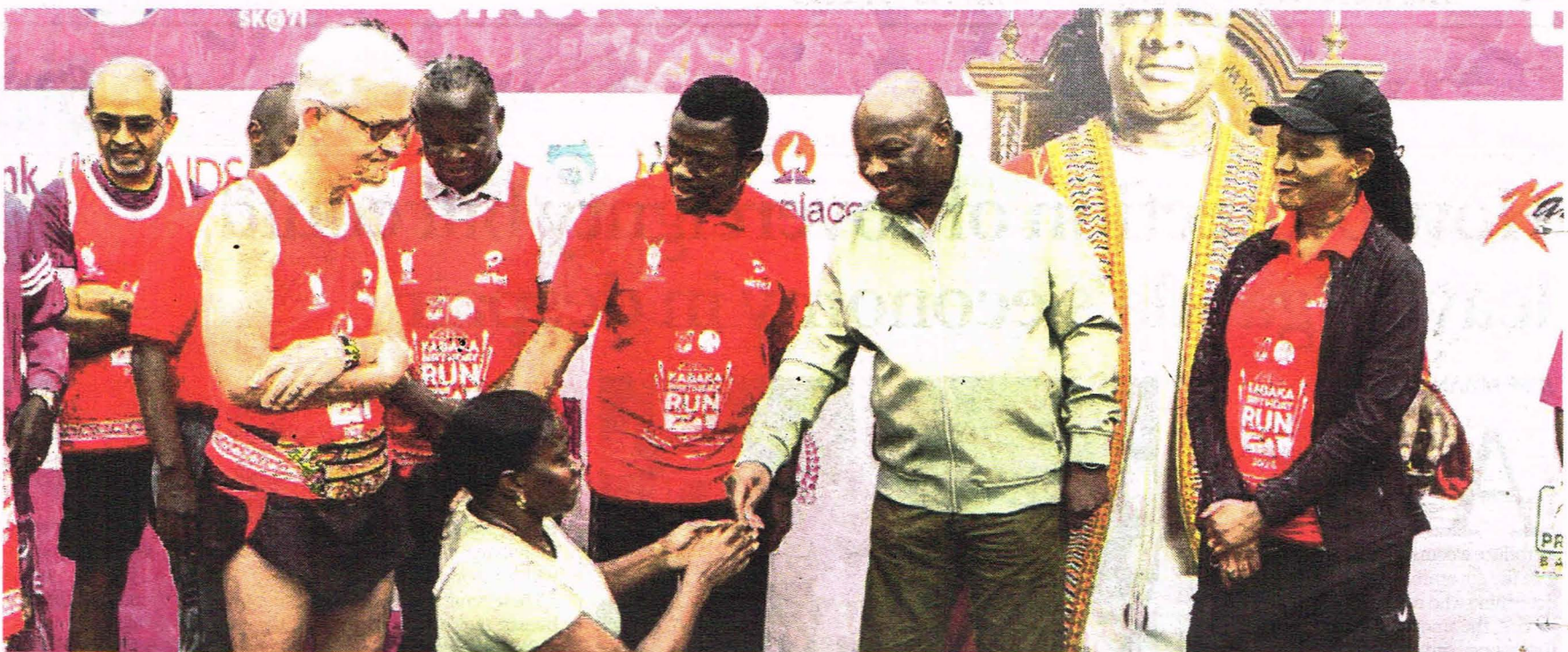
Kabaka Ronald Muwenda Mutebi II (2nd R) turned up to the Mengo palace (Lubiri) with his queen, Nnaabagereka Sylvia Nagginda (R) and Katikkiro Charles Peter Mayiga (C)