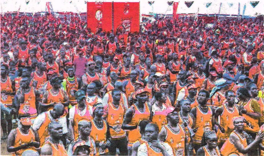
Thousands participated in the run