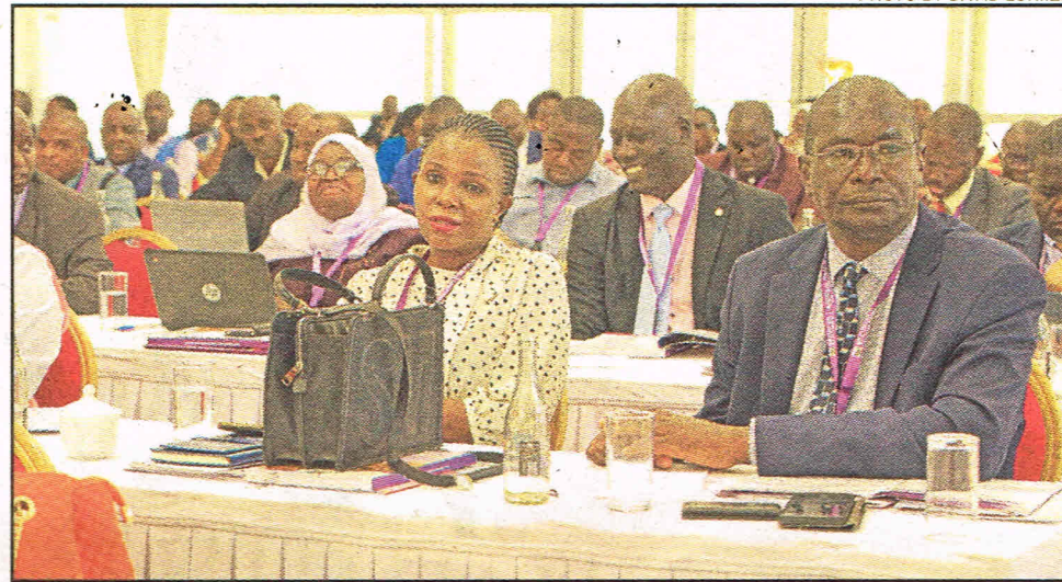
Headteachers of government-aided schools attending the ESC annual performance review on March 31 at Lake Victoria Serena Golf Resort and Spa in Wakiso district