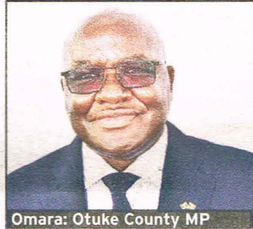
Omara: Otuke County MP

"But with the withholding tax, the bank would have to gross up the payment, pushing the total cost to about $1.2m."