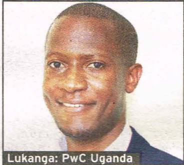
Lukanga: PwC Uganda