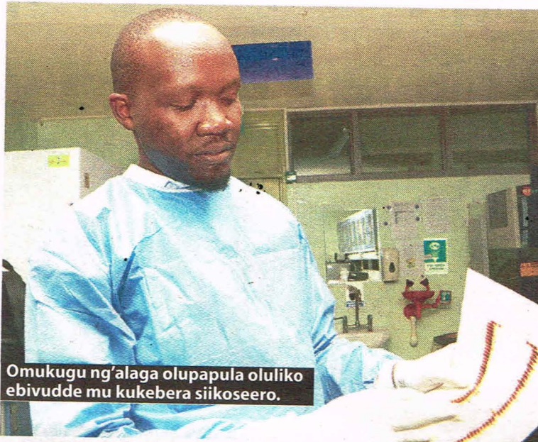
Omukugu ng'alaga olupapula oluliko ebivudde mu kukebera siikoseero.

Ekirungi kiri nti, bali mu kutendeka abasawo ku nkozesa yaabyo. Ekirala waliwo kkampuni ekola ebikozesebwa mu kuke-