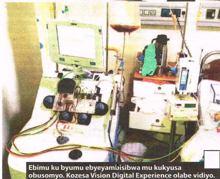
Ebimu ku byumu ebyeyambisibwa mu kukyusa obusomyo. Kozesa Vision Digital Experience olabe vidiyo.