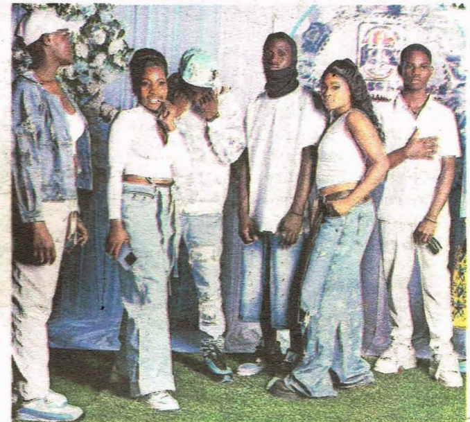
Denim proved to be the after luncheon fashion attire.