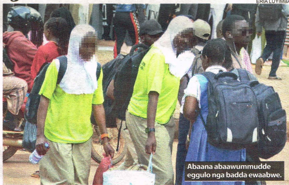
Abaana abaawummudde eggulo nga badda ewaabwe.

dwa disitulikiti y'e Wakiso n'ekitongole kya Mildmay e Kasenge ku Lwokubiri lwa wiiki eno, nga babangula abayizi abali mu siniya ku nneeyisa, abayizi baabuulidde abakungu nti okwambala obupati mululimi lwabwe baakikazaako "New Curriculum" era buli lwe bagamba nti tugenda mu "New Curriculum", baba babaguliizaako bannaabwe nti twambala obupati tugende tusikirize abalenzi!