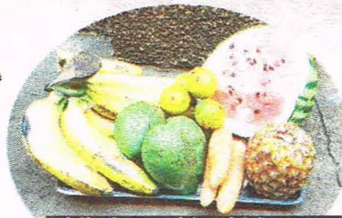
Ebibala nga bino birimu ebiriisa ebiyamba omwana obutafuna ndwadde.

zadde okutwala abaana okugembwa kubanga eddagala gyeriri mu malwaliro Yategeeza nti, Gavumenti yaakugenda mu maaso nga