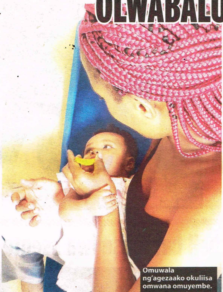
Omuwala ng'agezaako okuliisa omwana omuyembe.