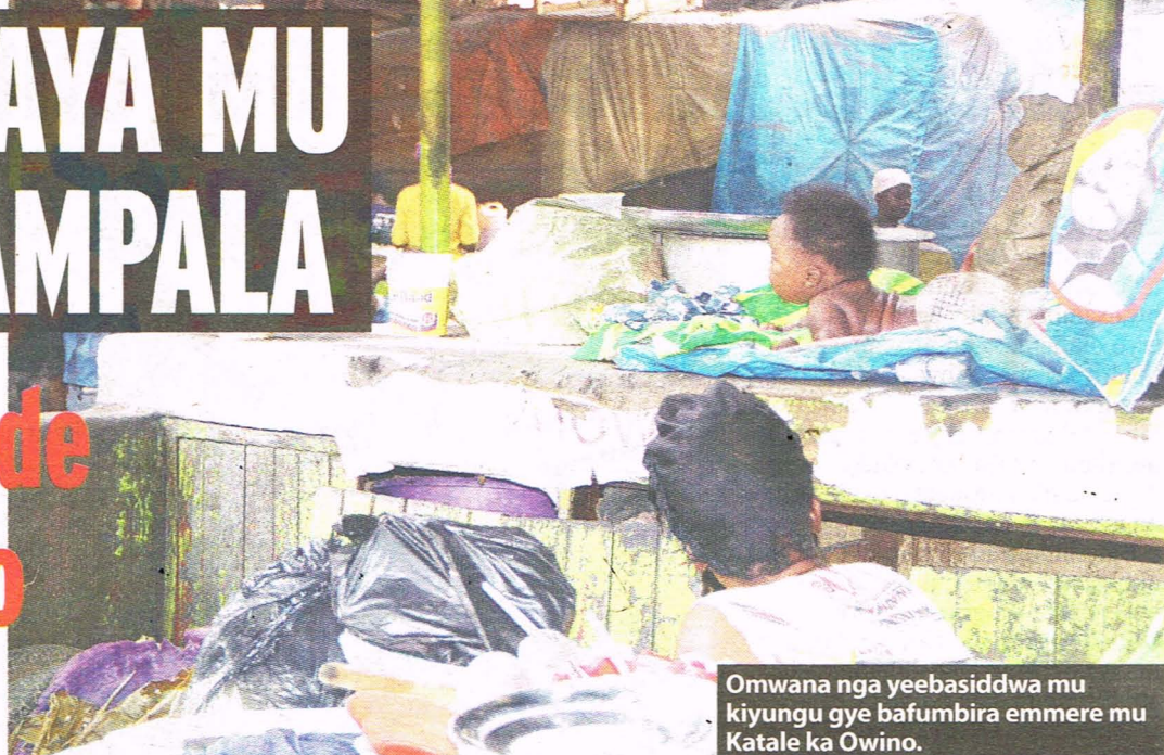
Omwana nga yeebasiddwa mu kiyungu gye bafumbira emmere mu Katala ka Owino.