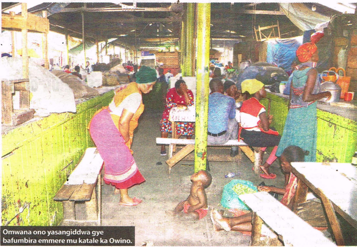
Omwana ono yasangiddwa gye bafumbira emmere mu katala ka Owino.