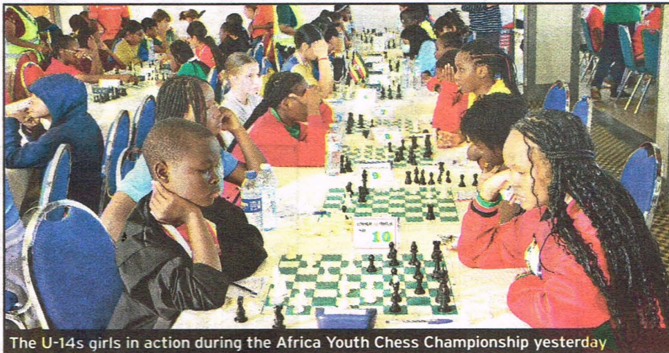
The U-14s girls in action during the Africa Youth Chess Championship yesterday