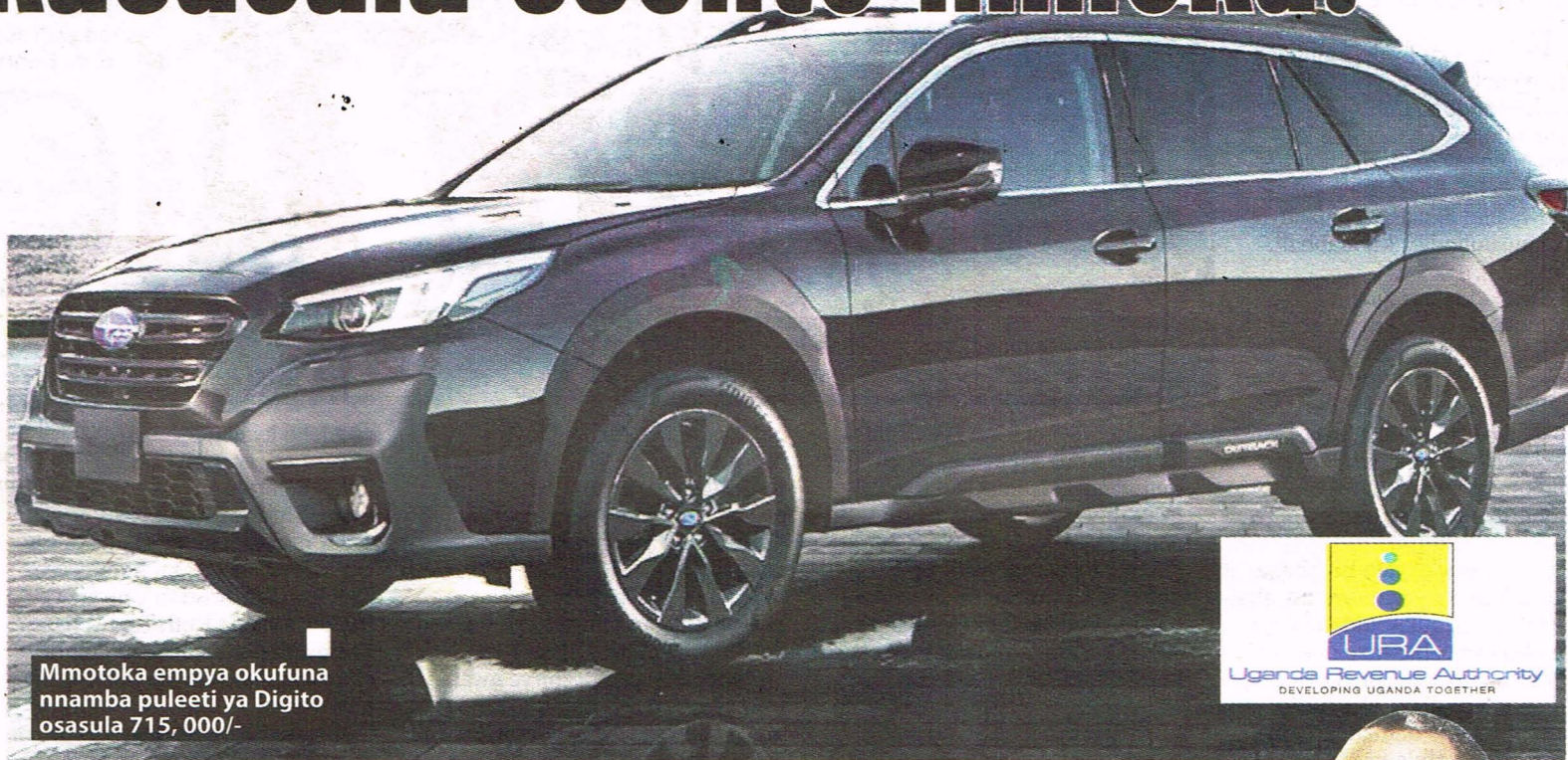
Mmotoka empya okufuna nnamba puleeti ya Digito osasula 715, 000/-

Buli lw'oggulawo bizinensi, n'ogiwandiisa ku musolo ne tukuwa TIN, olina obuvunaanyizibwa okututegeezaako bizinensi eno bw'eba efunyeemu okusoomoozebwa okugeza okugiggala oba okukyusa