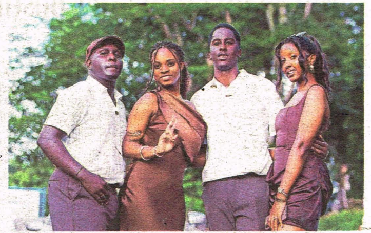
Brown and white is a combination made in heaven.