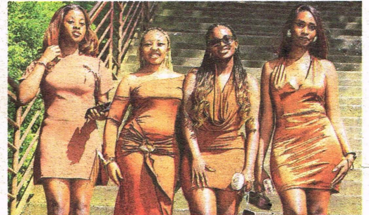
Shining bright in the chocolate brown attires for the cocktail session.