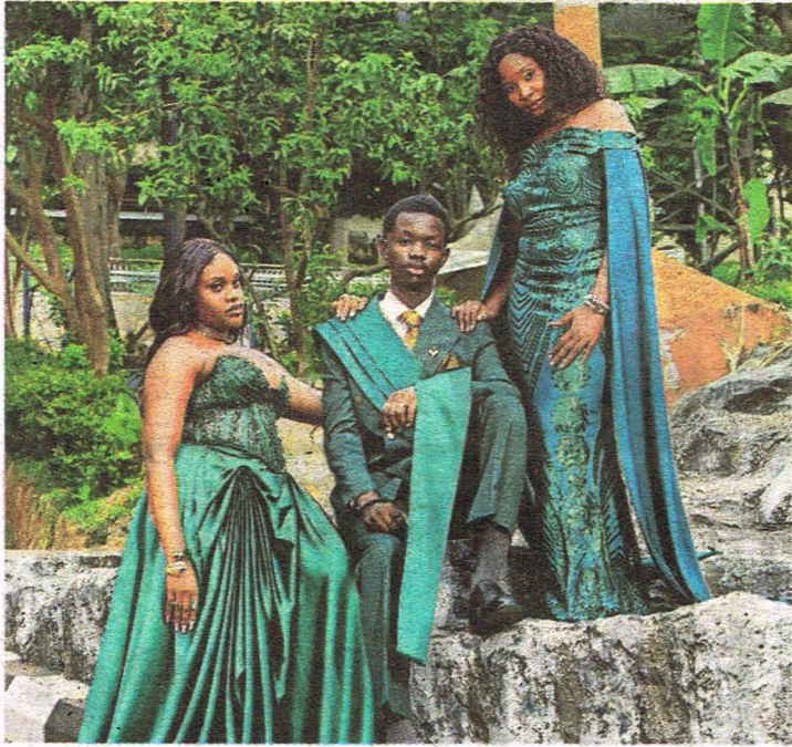
One king, two queens and a whole lot full green elegance.

At the red carpet, the candidates stepped out with confidence, delivering main character energy on what became an unofficial runway of style. It was a show of elegance, and youthful celebration.